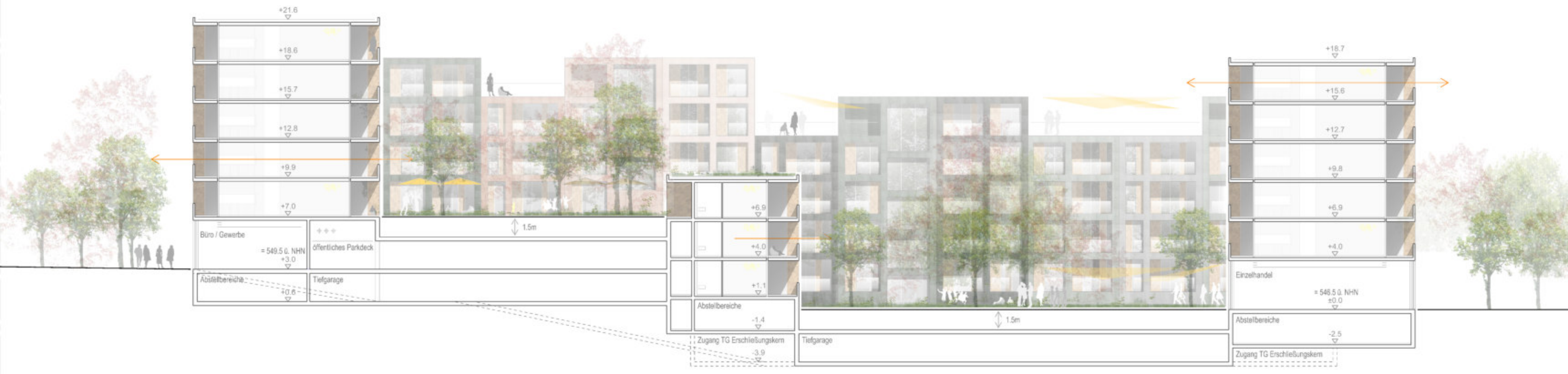
Schnittansicht A-A Hof Osten M 1:200