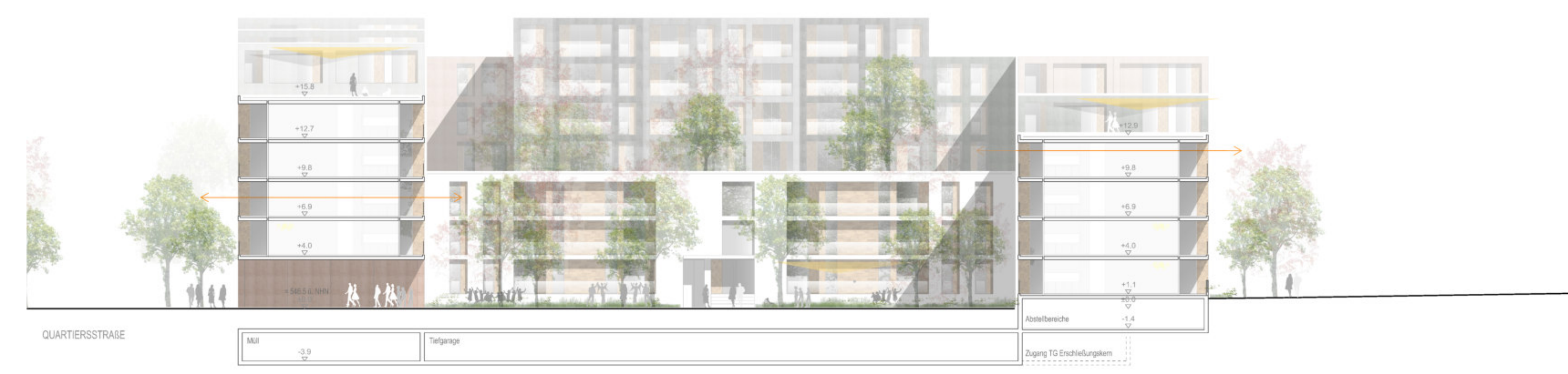
Schnittansicht B-B Hof Süden M 1:200