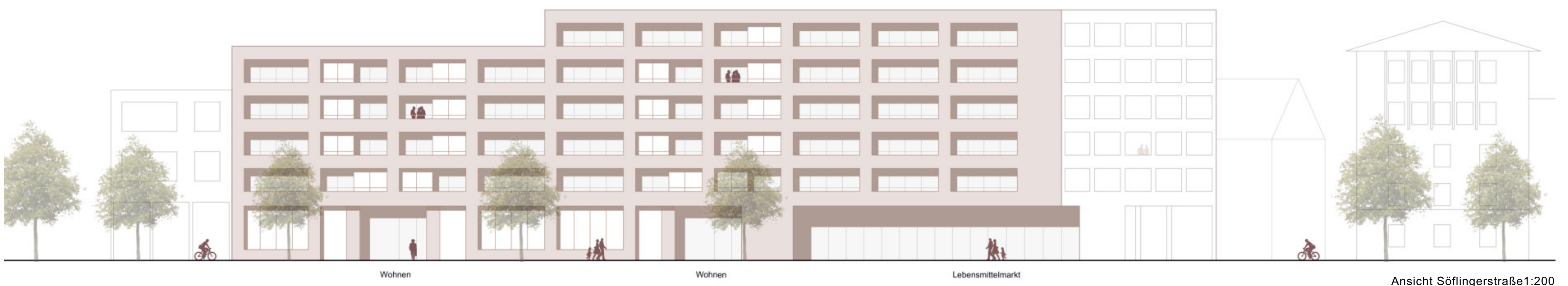
Ansicht Söflingerstraße 1:200